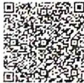
Registrar Pharmacy Council